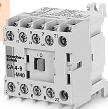
The CA4-9-M40 economically handles 1HP @ 460V

The CA4-9-M40 is a new addition to the already well- Continued - see 4-POLE page 4